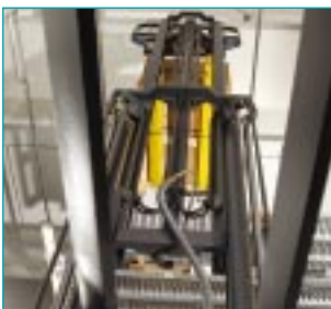
Good fork tip visibility

Designed by CAD systems, the truck frame has