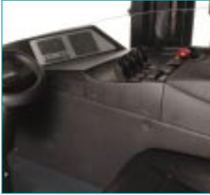
Simple, ergonomic controls

The AR-2R has been developed around an alternating current (AC) power system to provide the highest levels of performance in terms of hours of usage and operator comfort.