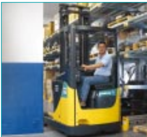
Very manoeuvrable in tight spaces

All the engines are completely encapsulated so do not require cleaning or the removal of residues or dust that normally accumulate in unshielded motors.