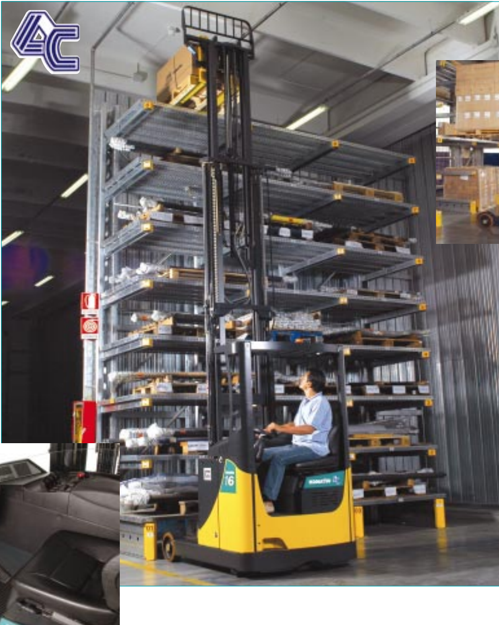
Rider Reach Truck