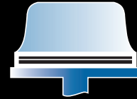
Cross section of Trelleborg® Press-on Solid Tire

This product line reaches way beyond the traditional acceptance levels of the industry. Highly advanced manufacturing technology ensures firm bonding between rubber and steel band, as well as other superior qualities. The comprehensive range of compound/profile combinations guarantees the right solution for every application.